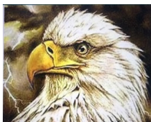
Great White Eagle

211 I laid my hands against the rock and looked up towards Heaven and started praying. I heard a Voice coming out of the top of the rocks there, said, "What are you leaning against, over your heart?" And I raised back like this, my bare shoulders; naked from my waist up, hot. I looked back. And there was wrote in the quartz, in the stone, " WHITE EAGLE "; JUST EXACTLY WHAT THE VISION SAID THAT THE NEXT MESSAGE WOULD COME FORTH BY . 212 I was so excited, I run home; got a camera and come back the next day, and took the picture of it. It was still there, wrote in the rock: " White Eagle. " (Dove leading eagle.)